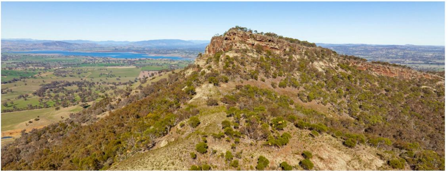
Table Top Mountain Charity Walk