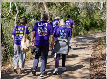
8 WALKING FOR MENTAL HEALTH