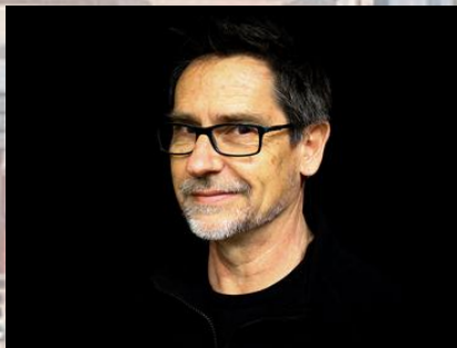
5-6 2025 DISTRICT CONFERENCE