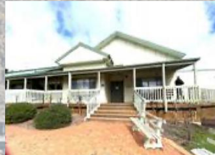
4 SALE OF CHILDREN FIRST FARM