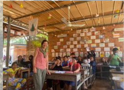
7 PARTNERS IN EDUCATION IN CAMBODIA