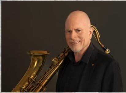
COVER, 3- DG STEPHEN'S NOTES