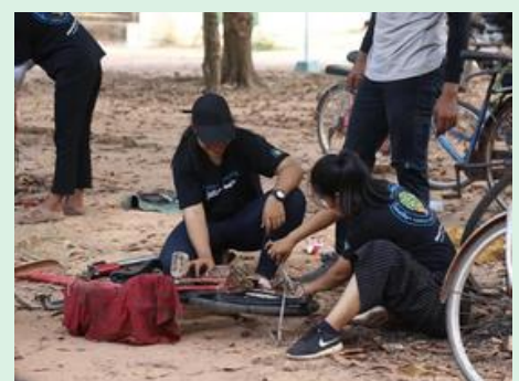
Helping to recycle bicycles for school students