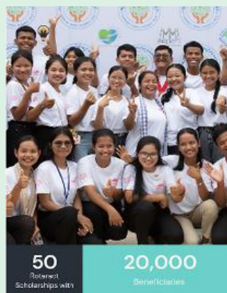
Rotaract Club members receiving University scholarships.