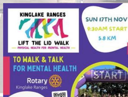
12-25 WHAT'S COMING UP, DEADLINES AND NOTICES