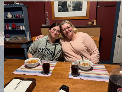
9-11 YOUTH NEWS