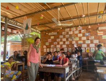
Offering teaching support in Siem Reap, 2023.

To Donate Now: Please see the project description on the RAWCS site, with a link to donate https://directory.rawcs.com.au/39-2023-24