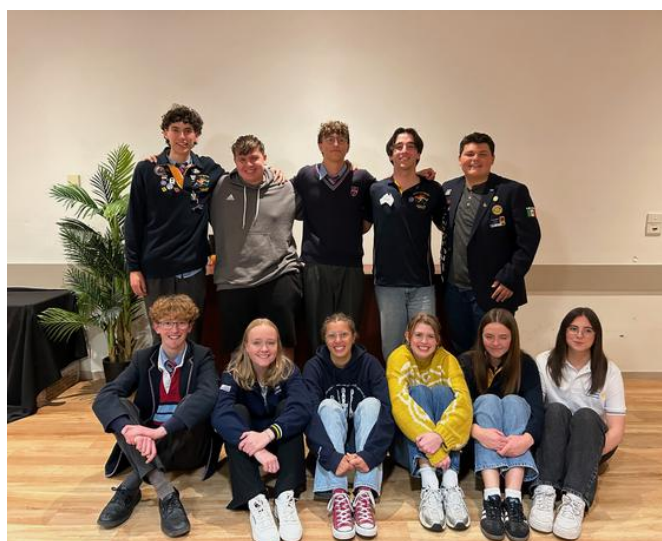
Benalla Exchange Students 2024.

The students in the photo are the current inbounds, the current outbounds, students who have been on exchange within the last 12 months and a long-term exchange student.