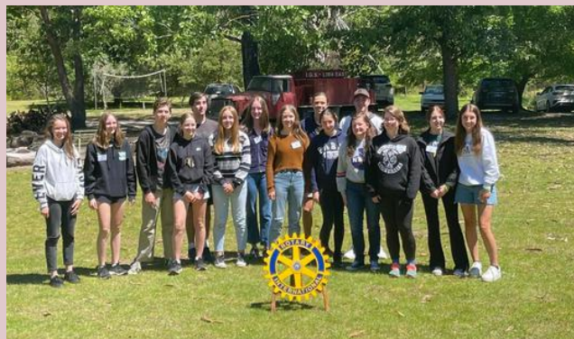
Outbound Students for July 2022

Your Rotary Club can help these wonderful young people by sponsoring their journey. If they have approached your Club to sponsor them, please give them the opportunity to speak to you regarding their desire to become a Rotary Youth Exchange Student. Our committee members are ready to support the students as they seek sponsor clubs from our District and we are also there to support the Clubs in their support of the students.