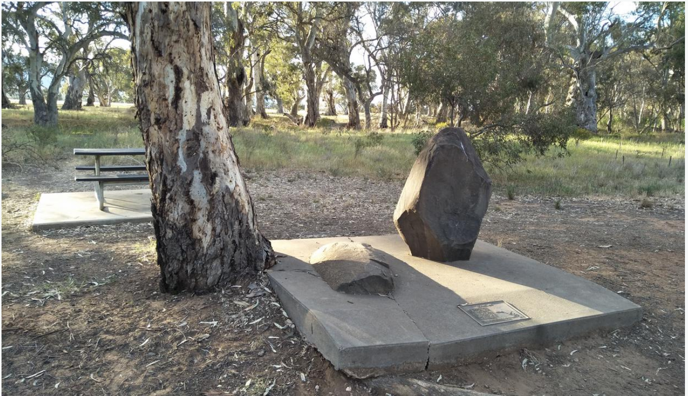
Goyder's Line Historical Marker, Annadale, South Australia about 100 km north east of Adelaide

Farmers are still keen to produce food and fibre for the local and overseas market provided they can make a profit. The risks have always been there, but two aspects that are vital for increased production to meet worldwide demand are good healthy soil and ability to adjust to climatic changes.