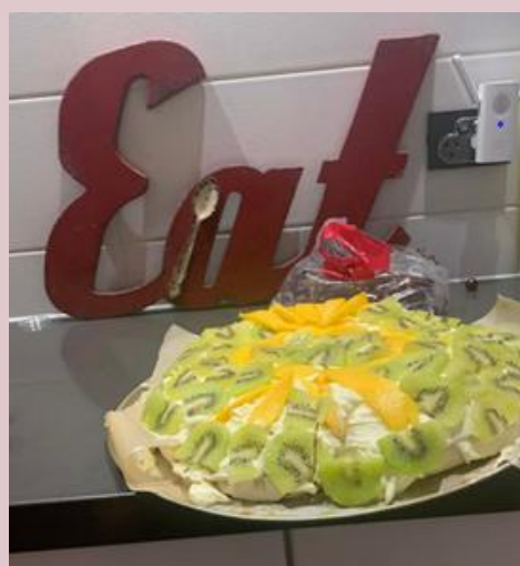
How great does this Aussie themed Pavlova look?