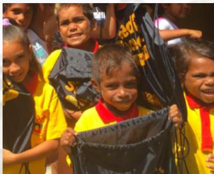
5 ROTARY FOUNDATION AUSTRALIA