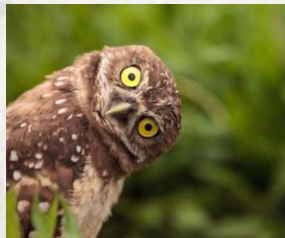
7 CONFERENCE UPDATE