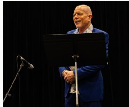
4 PRESIDENTS ELECT/CLUB OFFICERS TRAINING