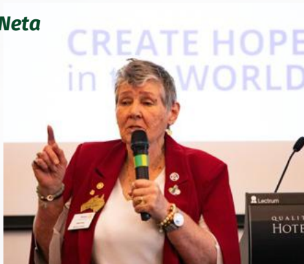
COVER DG NETA'S NOTES