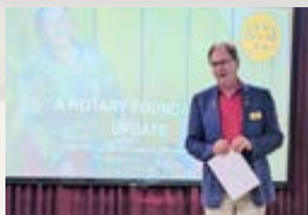
12 THE ROTARY FOUNDATION