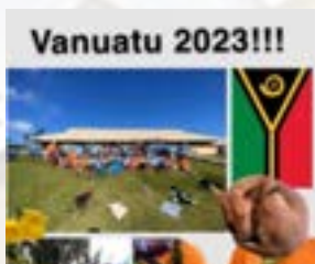
13 YOUTH NEWS