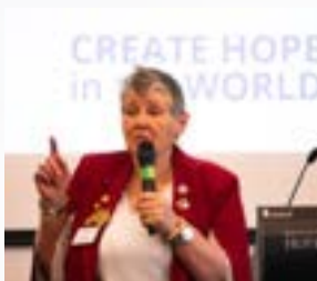
COVER DG NETA'S NOTES