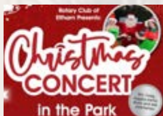
18 NOTICES OF EVENTS, DEADLINES ETC