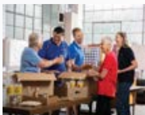
7 RETAINING YOUR MEMBERS