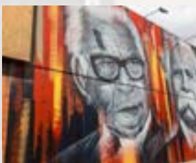
17 CONFERENCE UPDATE