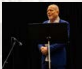
11 PRESIDENTS ELECT/CLUB OFFICERS TRAINING