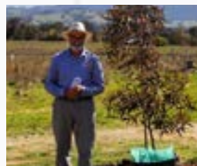
5 REMEMBERING ANNE AT THE ROTARY PEACE ARBORETUM