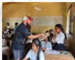
8 CAMBODIA AS YOU HAVE NEVER SEEN IT BEFORE