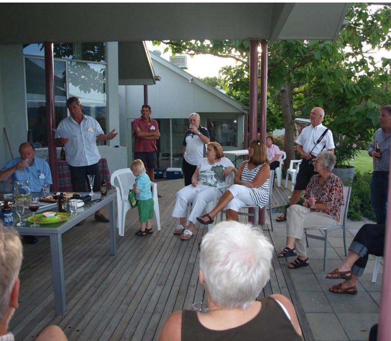
Full report next week