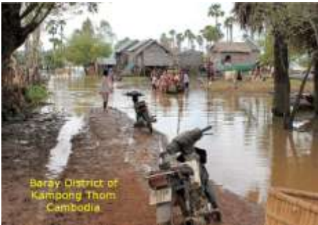
Baray District of Kampong Thom, Cambodia

As the floodwater recedes water contamination and therefore disease, will become a major life threatening issue. We can