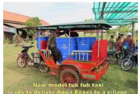
New model tuk tuk taxi ready to deliver Aqua Boxes to a village.

She need "NOW" water treatment (chlorine) water filters, mozzie nets, fishing nets, food (rice) and other