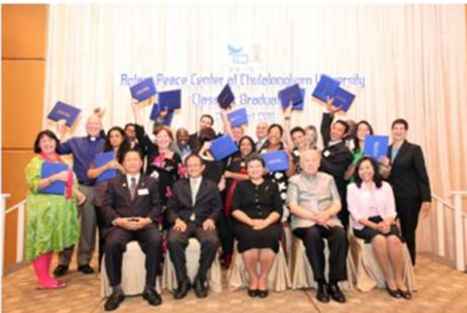
The 2011 Summer Rotary Peace Fellows graduated from the Professional Development Certificate program in June. The Winter 2012 class will start in February

Rotarian Cavitt's example proves that it is extremely beneficial for districts to reach out to local organizations to recruit fellows. For more ideas on how to recruit, see the Rotary Peace Centers Recruitment flyer.