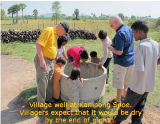
Village well at Kampong Spee. Villagers expect that it would be dry by the end of month.