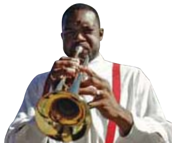
Lively music worthy of the birthplace of jazz