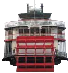
Steamboat rides along the mighty Mississippi