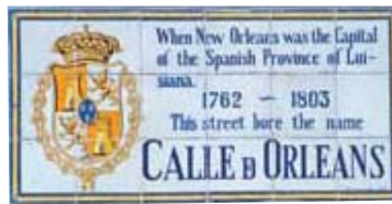
The legendary French Quarter