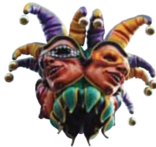
The festive spirit of Mardi Gras