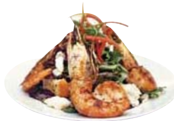
Cajun and Creole cuisine prepared by world-class chefs